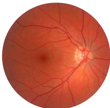
An example of a healthy eye recorded by our digital camera

Retinal photography is included as standard in our private eye examination